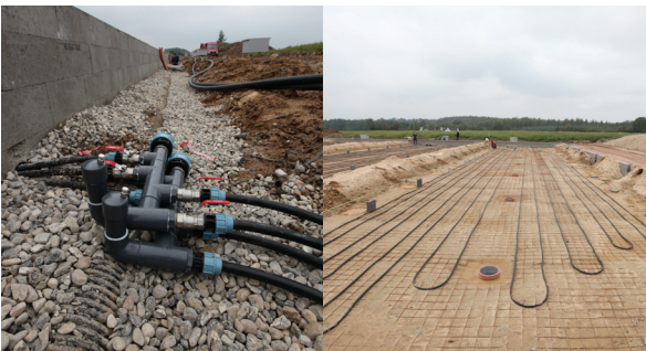
Slurry cooling systems under construction